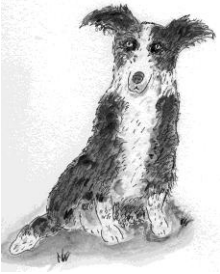
dog (Border collie)

Directions: What kind of animal is each? If it has a name in the book Rescue in the Wild , give that name.