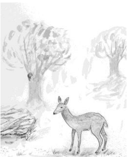
baby deer (a fawn)